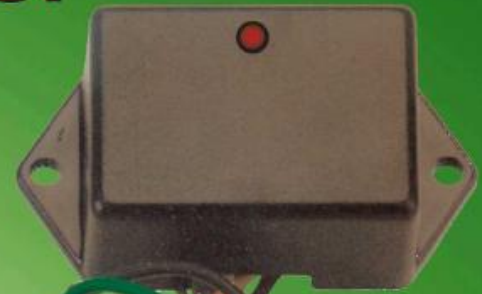
OEM Interface Module