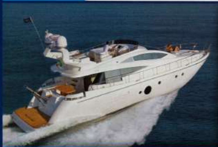
NEWS BRIEFS - PAGE 22