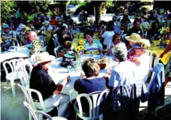
Great crowd showed up for the event to show their support.

troops items they need and to let them know that someone at home is looking out and cares for them. Basic items like sunscreen or deodorant make an enormous difference to those stationed on the frontlines without many of the comforts we take for granted. Whether you know of a specific service member overseas or are reaching out anonymously, volunteering to collect its contents, sort them out, or package them, is the right thing to do," said Azusa Mayor Rocha.