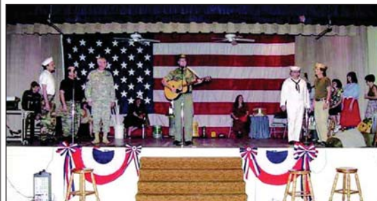
Local actors put on USO Show in Arcadia.